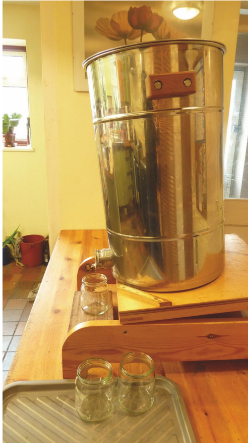
Figure 8: Bottling honey

The honey jars that you purchase have usually been re-packed since they came from the manufacturer. If you are in any doubt about their cleanliness they should be washed before use and this is where a dishwasher comes in handy. It is also good practice to warm jars in an oven before filling them and a temperature of about 50°C is suitable. Lids can also be a problem. Metal lids should not be re-used (for honey that is for sale) because once the lacquer on the threads has been damaged the acidity of the honey quickly corrodes the steel and an unsightly black deposit