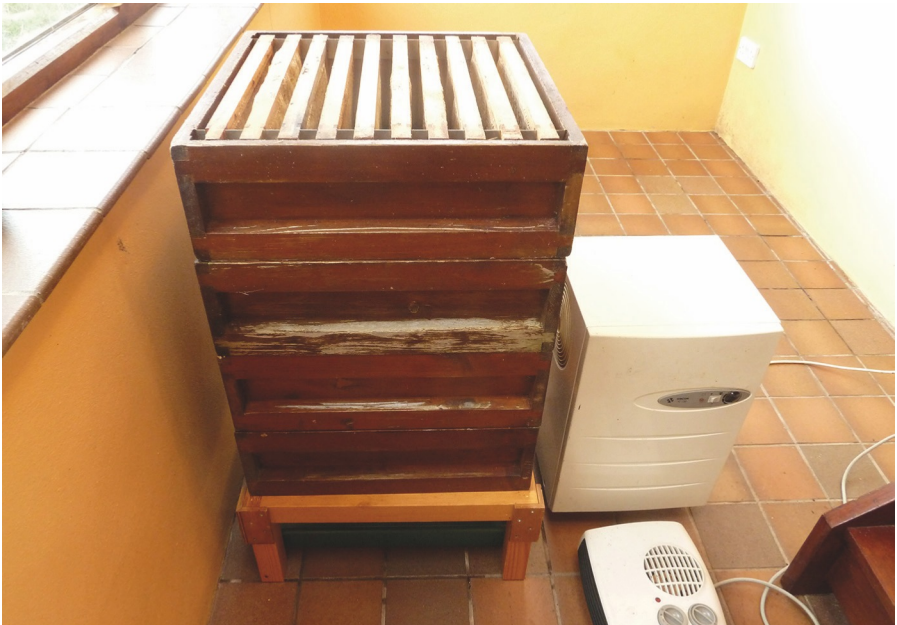
Figure 2: Dehumidifier and super stand

However, it is quite easy to apply supplementary drying after the honey has left the hive if it is still in the combs because these have a large (vertical) surface area for gaseous exchange – this is how the later stage of drying occurs in the hive. If you are beekeeping on a scale that justifies having a well-sealed honey super storage facility and a dehumidifier the problem is easily solved. Small, low capacity