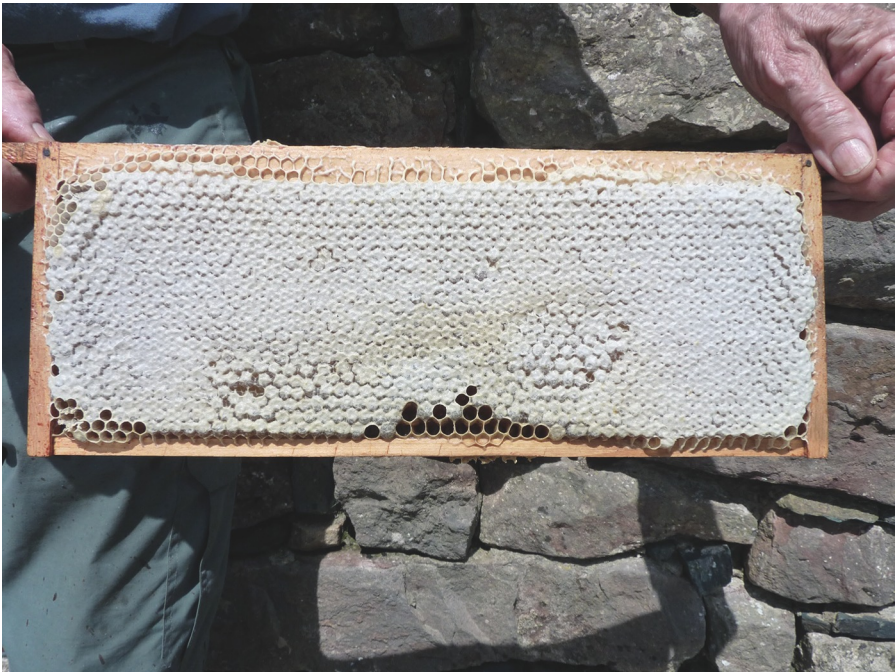
Figure 1: Frame of honey ready for extraction

Another advantage of taking intermediate crops of honey during the season is that it economises on equipment – supers can be extracted and the boxes and combs returned to the hive to be re-filled. It also reduces the amount of lifting that is required to make routine inspections of the brood area for the rest of the season. However, beware of going to extremes with early removal because subsequent bad weather could lead to colony starvation. If oil-seed rape honey is involved you have no choice but to take an intermediate harvest as soon as flowering is in decline. If the bees have access to autumn sown oil-seed rape then this honey will almost certainly have to be harvested in April or early May. Extraction must also be completed without delay or the honey will set in the combs.