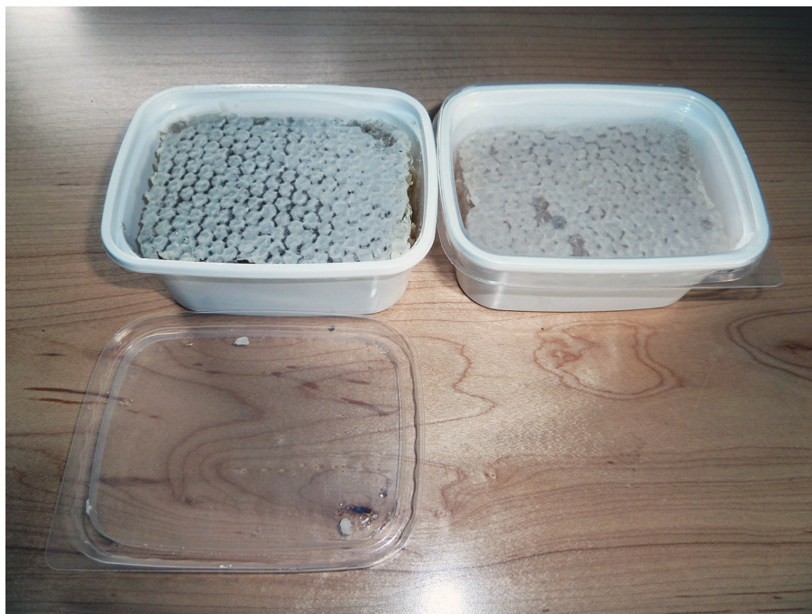
Figure 9: Cut comb