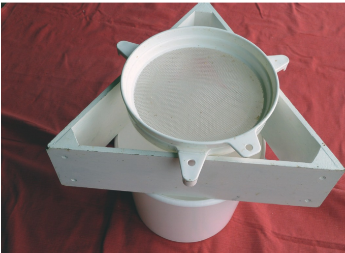
Figure 6: Filter spacer

Most modern extractors have only a minimal reservoir under the cage for honey so the tap at the base has either to be left open or strategically opened to avoid flooding the bottom bearing with honey (which does not help free rotation!). We drain our honey through a conventional double strainer into 30lb plastic buckets and this removes all but the smallest debris from the honey. When handling honey bear in mind that the most silent thing in the world is overflowing honey! When the tap on the extractor is open the receiving container must be securely positioned under it and must have sufficient capacity to accommodate the amount to be delivered. There is nothing worse than finding a pool of your precious honey on the floor!