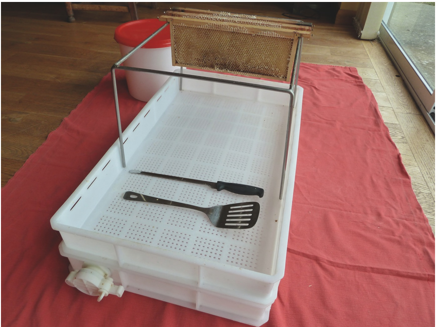
Figure 4: Cold extracting tray

Sorting that out without killing bees is no mean task!