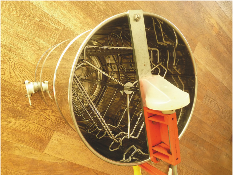
Figure 5: Tangential extractor

You have to get to know your own extractor; how best to load it, how fast you need to turn the handle or control the motor speed but here are a few tips about extraction.