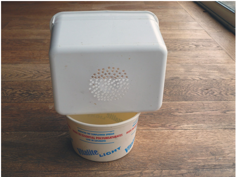
Figure 3: DIY capping drainer

Nothing more complicated (or costly) than a ham or salmon knife with a blade length of 10-12 inches (25-31mm) is required to uncapping honey. A sharp knife works perfectly well cold and there is no need to keep dipping it in a jug of hot water – as is sometimes suggested. Most people use the wooden surrounds of the frames as guide for the uncapping knife but if the combs are fat it is possible to cut higher and remove just the cappings. An uncapping fork or ordinary domestic fork can be used to uncapping any surfaces that are below the level of the knife cut.